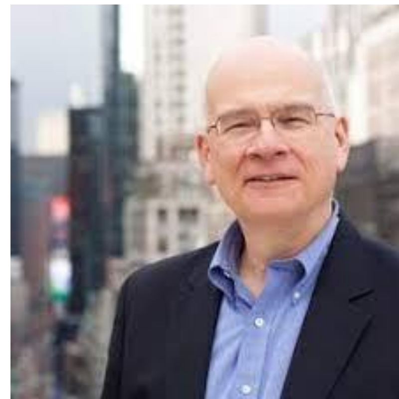
Tim Keller Generous Justice

“The Bible is a book devoted to justice in the world from first to last...The biblical gospel of Jesus necessarily and powerfully leads to a passion for justice... A concern for justice in all aspects of life is neither an artificial add-on nor a contradiction to the message of the Bible... I have observed over the decades that when people see the beauty of God’s grace in Christ, it leads them powerfully toward justice.”